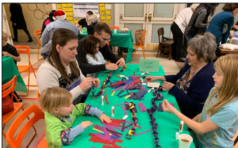
(top & middle) Lots of fun and creativity at the Advent Crafts Workshop; (right) Second Sunday crew packing yummy lunches including a holiday card for those in need.