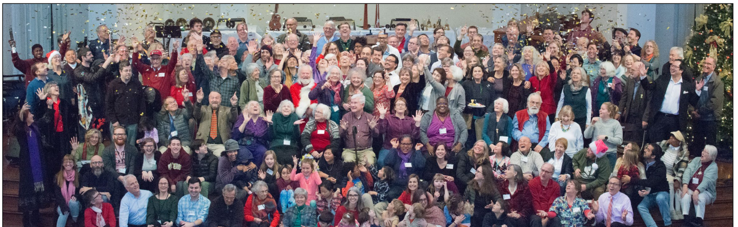
Celebrating with confetti as the church photo was taken after worship on Sun., Dec. 15.

Sun., Jan. 12, Immediately after worship, Sanctuary